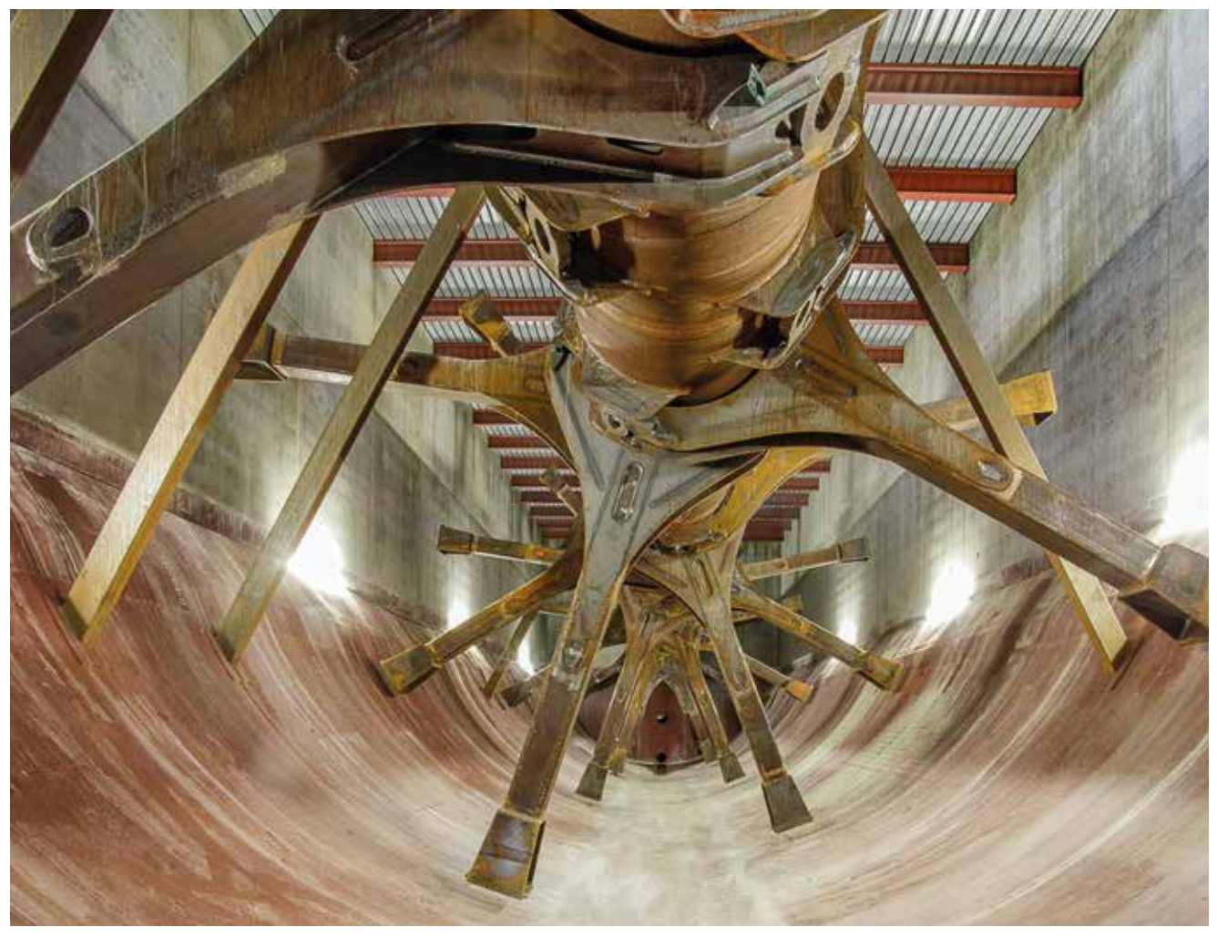
TTV digester - internal view