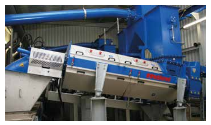
Thöni TSP 350C screw press