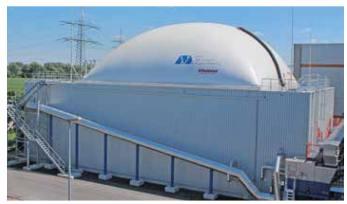
Biogas plant with gas storage unit