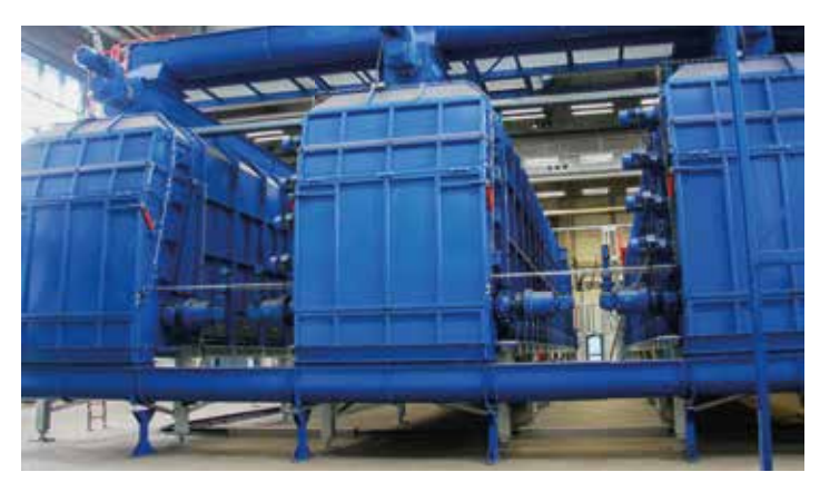
Thöni TBM silo module

Our team of highly qualified specialists will advise and support you from design to the successful commissioning of your biogas plant. We know every detail of our plants and can thus react quickly and flexibly to meet your needs.